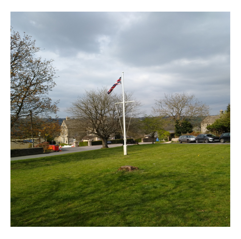
Flying the flag for Her Majesty the Queen's 95th birthday